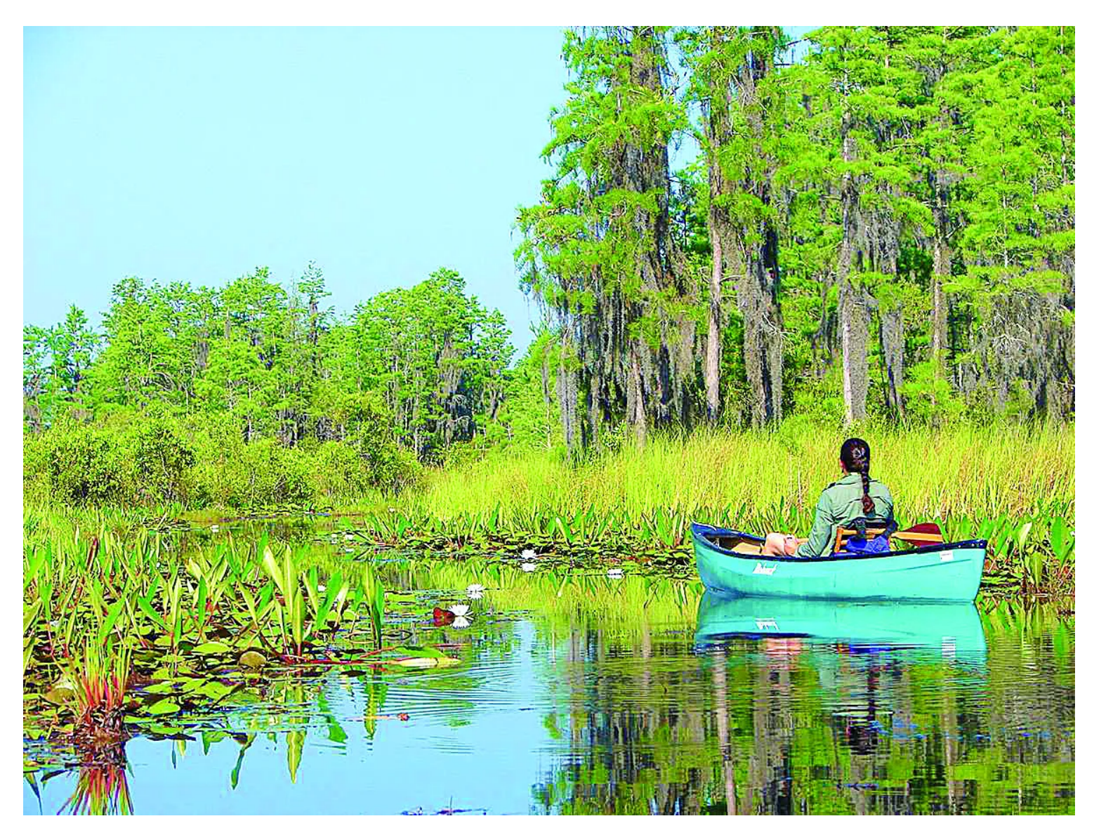
Okefenokee Swamp

by Sally Bethea November 26, 2023 | 3:39 pm